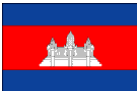
Cambodia – Department of Wetlands and Coastal Zones, Ministry of Environment