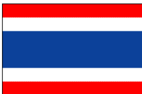
Thailand – Department of National Parks, Wildlife & Plant Conservation, Ministry of Natural Resources and Environment