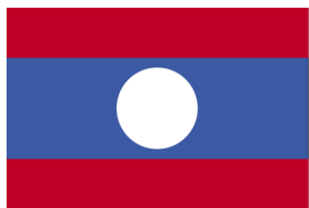
Lao PDR – Water Resources and Environment Administration