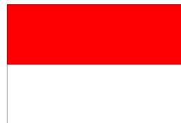
Indonesia – Ministry of Environment/Riau Province