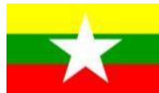
Myanmar – National Commission for Environmental Affairs, Ministry of Forestry