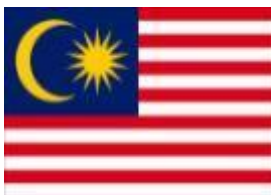
Malaysia – Forestry Department Peninsular Malaysia,/Selangor