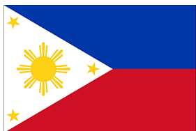
Philippines – Protected Areas and Wildlife Bureau, Department of Environment and Natural Resources