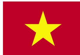
Viet Nam – Viet Nam Environment Administration, Ministry of Environment and Natural Resources